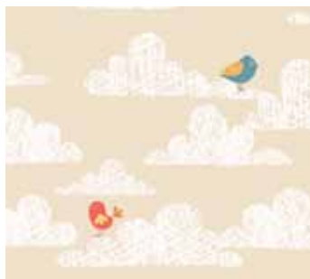
1206/Q BIRDS ON A CLOUD