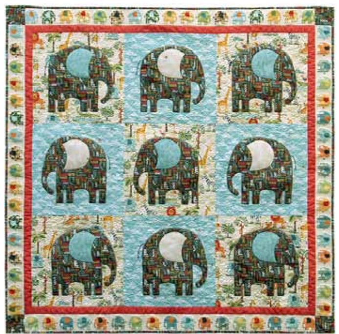
JUNGLE by HILARY GOODING

FINISHED SIZE APPROX 42" x 42" (107 x 107cms)