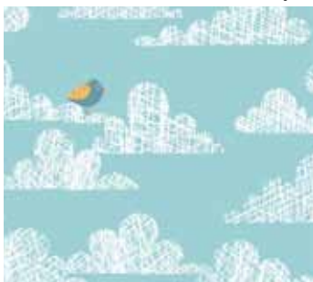
1206/B BIRDS ON A CLOUD