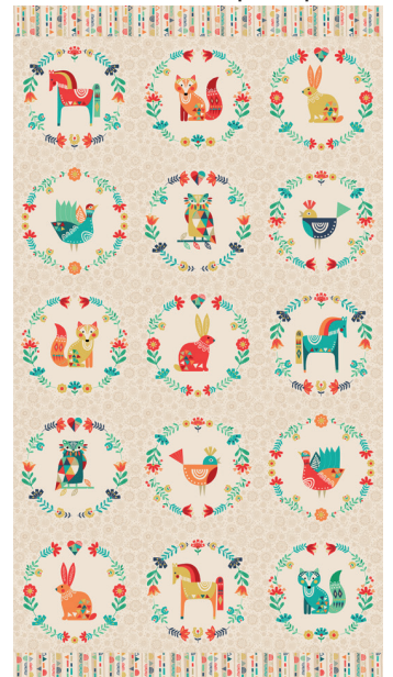
2308/Q Panel each panel 60 x 112cms (24" x 44")