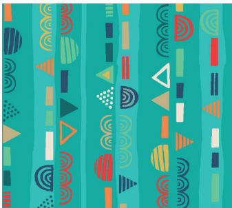
2306/T Scallop Stripe