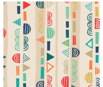
2306/Q Scallop Stripe