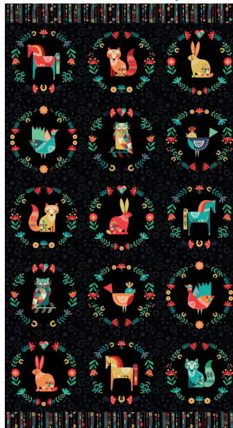
2308/X Panel each panel 60 x 112cms (24" x 44")