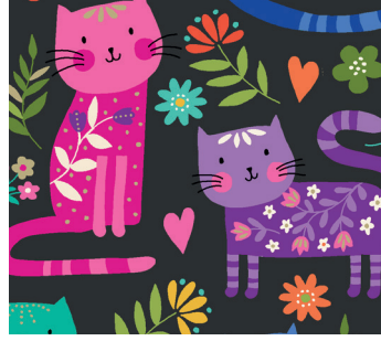
*2348/S Cats Allover