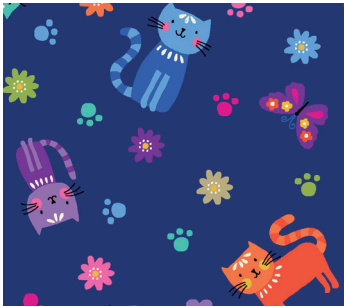
*2349/B Scattered Cats