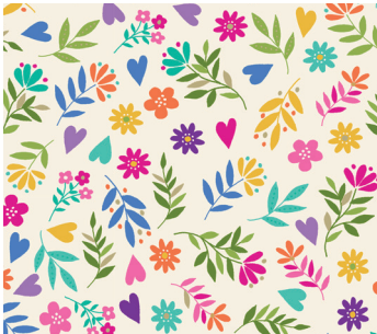
*2351/Q Ditzzy Flowers