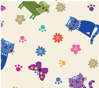
*2349/Q Scattered Cats