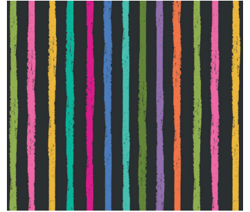
2347/S Chalky Stripe