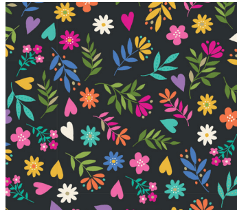
*2351/S Ditzzy Flowers