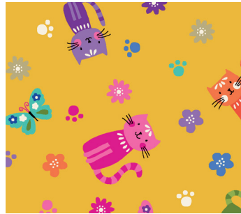
*2349/Y Scattered Cats