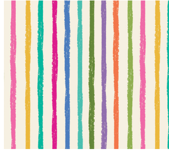
2347/Q Chalky Stripe