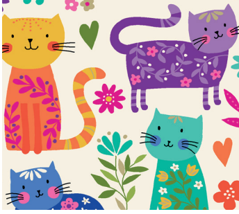
*2348/Q Cats Allover